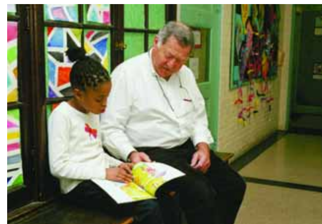
A DETAIL FROM A PHOTOGRAPH BY ALEX HARRIS ©

Experience Corps members provided more than 250,000 hours of tutoring and mentoring services to nearly 20,000 students nationwide during the 2002-2003 school year.