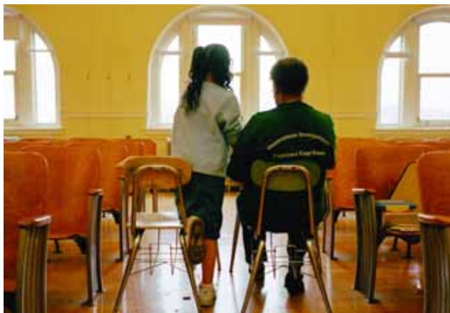
A DETAIL FROM A PHOTOGRAPH BY ALEX HARRIS ©